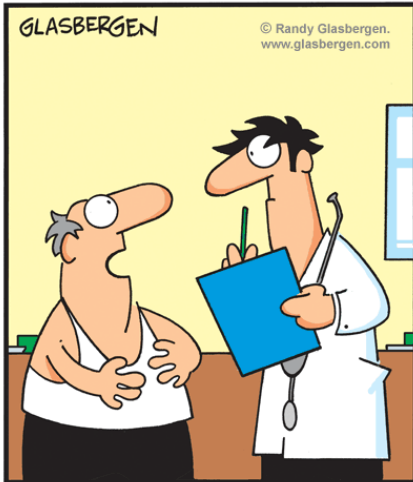
“My belly is a vital part of my 401(k) plan. I may have to live off this fat when I retire!”